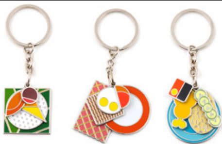
Staples KeyRing by Roy Poh S$28 each